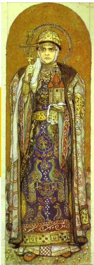
Kiev's princess Olga