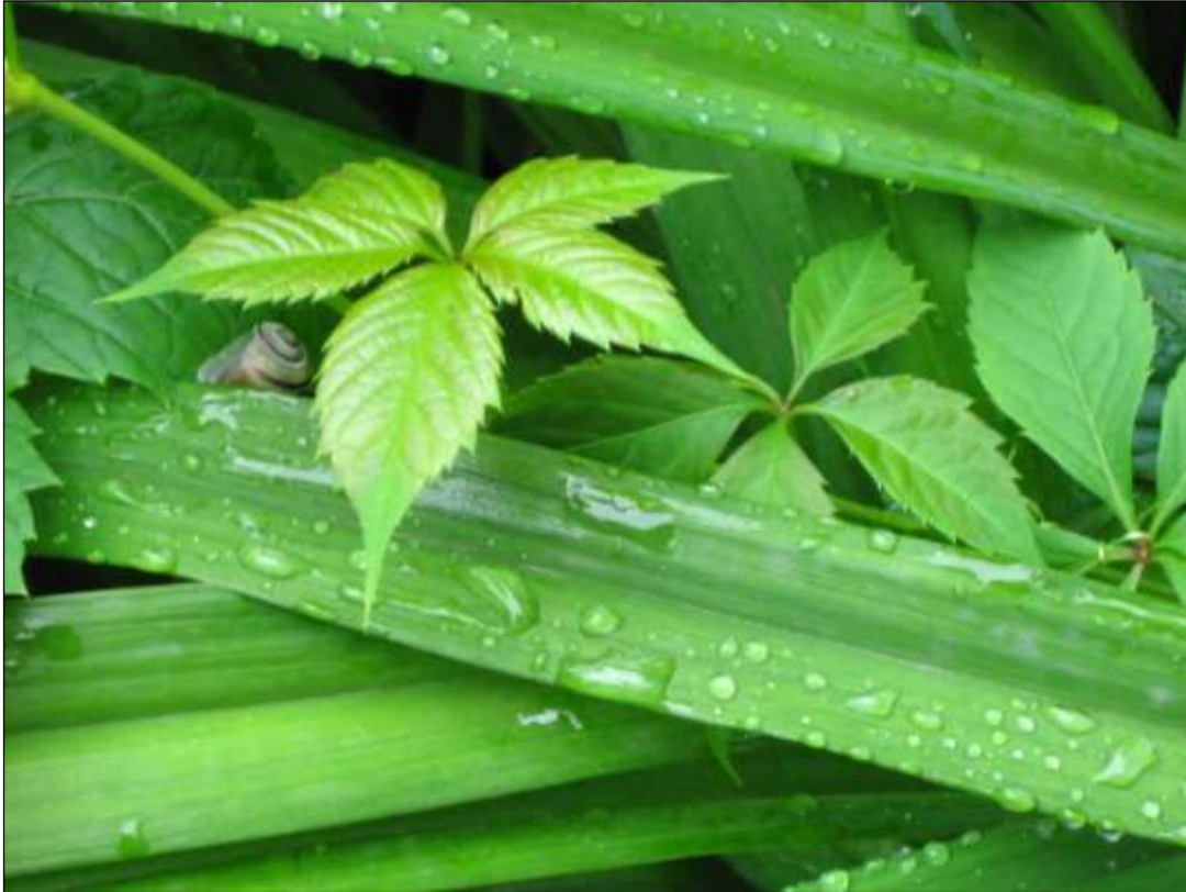
This is my best photo of grass.